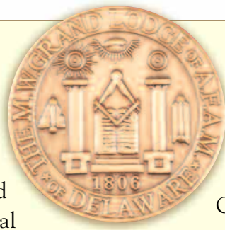
Reverse of Bicentennial Coin shown actual size.

These collections are being issued in very limited editions to assure their importance and historical significance. They represent the Pride, Dedication, Determination and Devotion we give in support of our great fraternity.