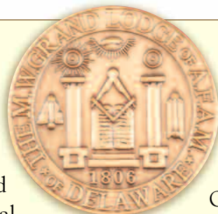
Reverse of Bicentennial Coin shown actual size.

These collections are being issued in very limited editions to assure their importance and historical significance. They represent the Pride, Dedication, Determination and Devotion we give in support of our great fraternity.